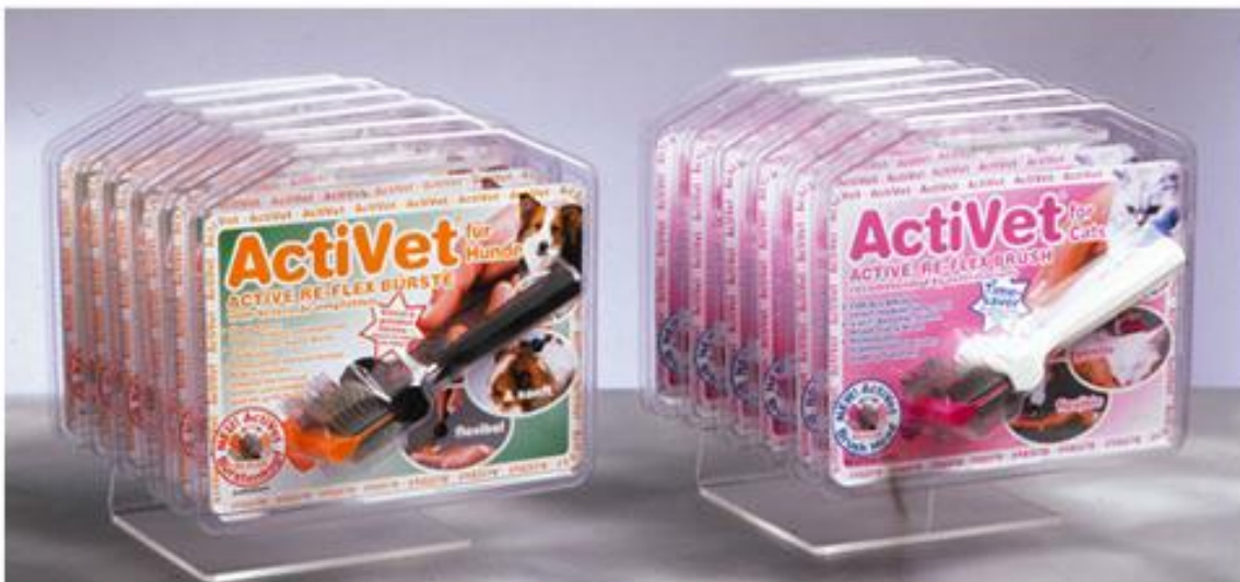
The first ActiVet point-of-sale displays already explained the functional character of the brushes in writing and in pictures