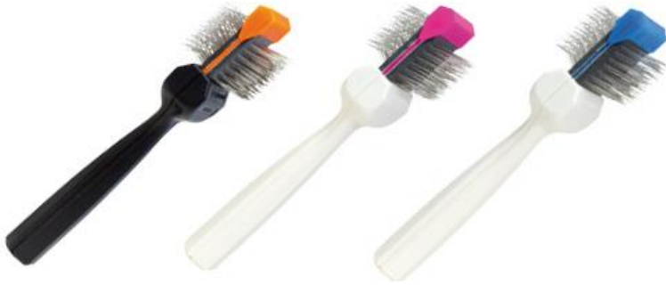
The “hard”, “medium” and “soft” brushes developed by SVI and Monti in-line with the ActiVet system