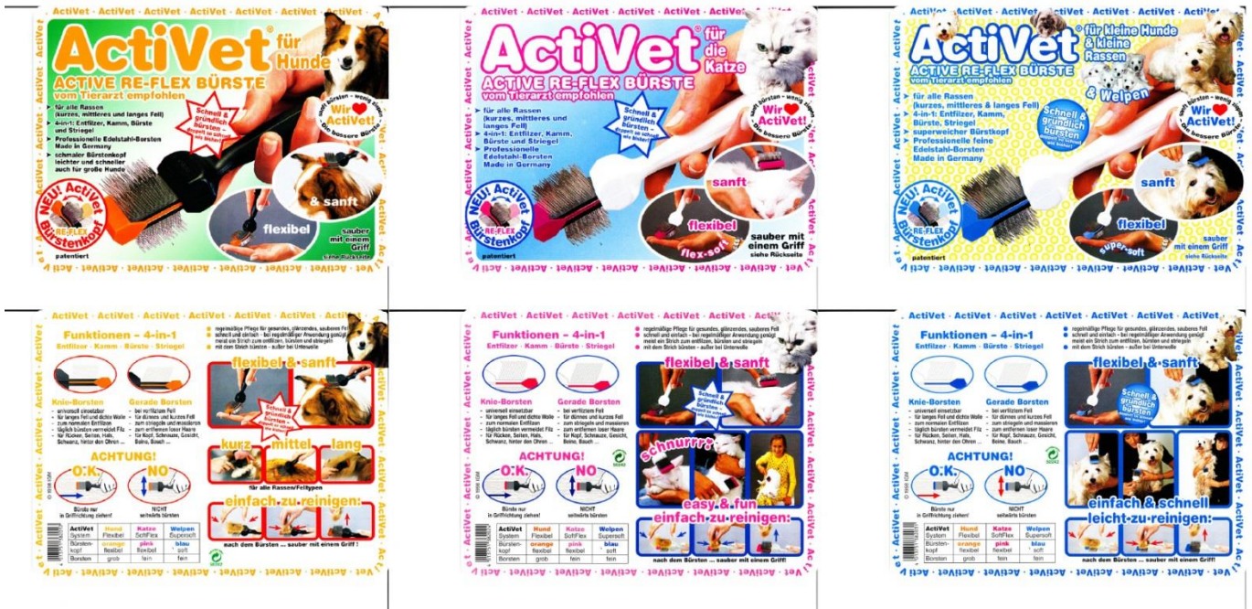
The novel brush concept on the market (1997/98)