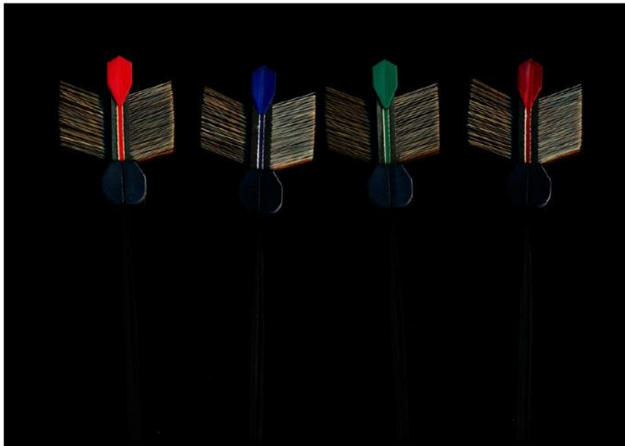
In 1994 the different types of flexible brush were already identified using different colours