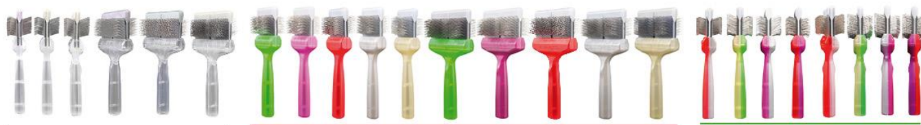
Diamond daily Care