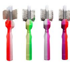
...all of the DUO range brushes are also available as MEGA brushes with a width of 9cm

ActiVet new generation, DUO, the multifunctional eco brushes