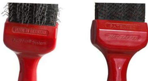
The “MatZapper” developed by SVI and Monti in-line with the ActiVet system

Shortly afterwards, SVI GmbH in cooperation with Monti GmbH, developed the “extreme untangling brush” with an optimised attachment, i.e. brush arrangement, and – in order to prevent improper use – a striking grip colour – because this brush is not suitable for brushing unmatted or untangled fur. During the first 10 years, controlled sales of this brush were only made to professionals (breeders and dog groomers).