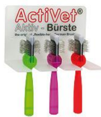
3x wall bracket for up to 6 brushes