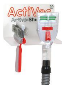
Combination wall bracket with AntiVac system

ActiVet new generation, wall bracket, AntiVac