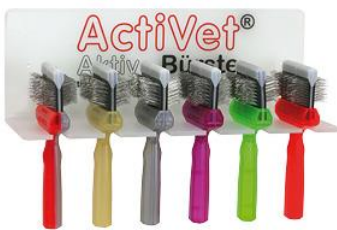
6x wall bracket for up to 12 brushes

True to the traditions of the companies Monti-Werkzeuge and Savoir Vivre Int. GmbH, further innovations include continuous optimisation in the area of product development. To round off the range, specially manufactured wall brackets are available in various sizes for salons, professional users, breeders and ambitious amateur dog owners.