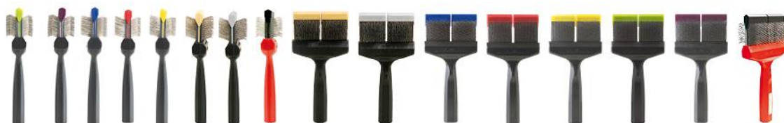
The comprehensive ActiVet system, sold for a time under the Les pooch label, developed and manufactured by Monti/SVI. The respective “imitators” only launched individual/fewer models onto the market.

While the first ActiVet systems were popular as a result of their particularly smooth operation, applications became desired over time in which the brush “grabs” the fur (as with conventional tools) – but WITHOUT the “snatching” and “tweaking”. This is exactly what the developers Knoll and Monti achieved with the resulting “Coat Grabber” system.